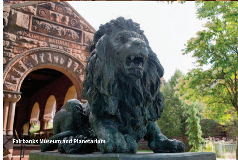
Fairbanks Museum and Planetarium