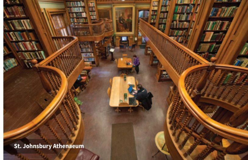
St. Johnsbury Athenaeum