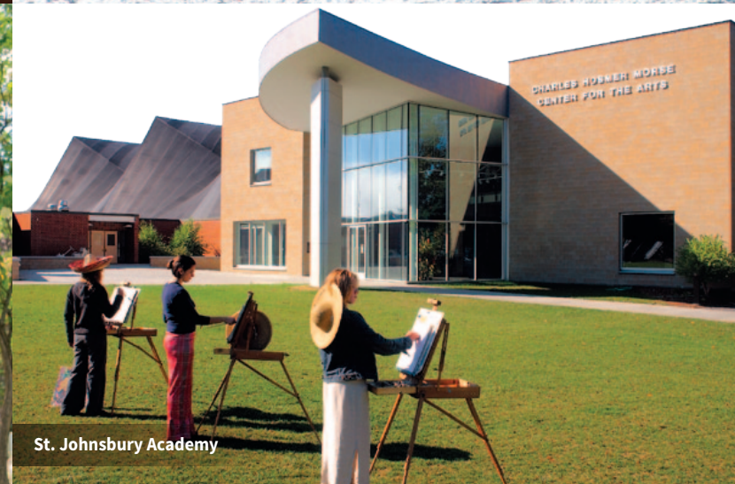
St. Johnsbury Academy