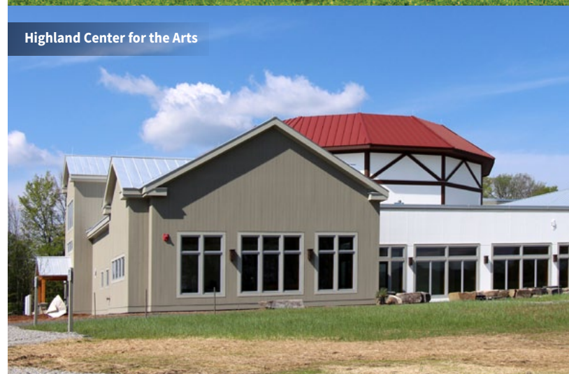
Highland Center for the Arts